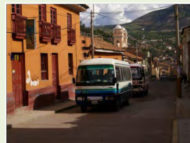
Kind of bus we're praying about for the Bible Camp in Ica