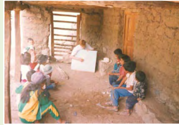
First Sunday school class Ayacucho - 1997