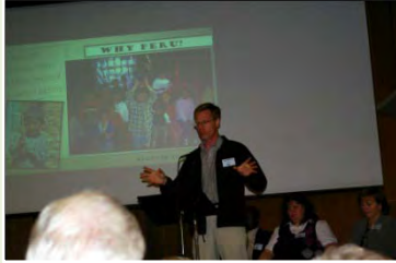
Sharing with believers in Ontario the Lord's Work in Peru

suitcases but by the time the place was made available to us the Lord had provided all the furniture we needed, principally through the intercession a loving Christian couple who had been praying for us. While at home we've enjoyed the use of my parents car and our children have been able to attend an elementary school only a couple of blocks away. For a family that left Peru not knowing what lay ahead the Lord has worked things out in ways that we could never have imagined.