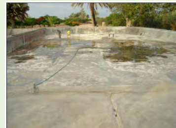
Completed repairs to the pool at the camp in Ica in preparation for the summer Bible camps.