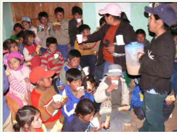
Christmas Sunday School Programs held in Ayacucho in December