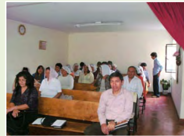
Mini conference at one of the assemblies in Ayacucho