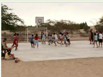
Youth camp at Betel Bible Camp in Ica.